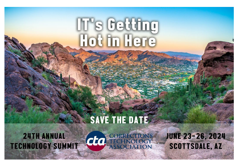
IT's Getting Hot in Here

2024 CTA Technology Summit June 23 – June 26, 2024